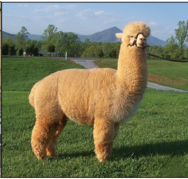
MAMALAMALLAMA—THE DAILY WEEKLY

Newest alpaca model is six times more energy efficient than the traditional SafeRide buses.