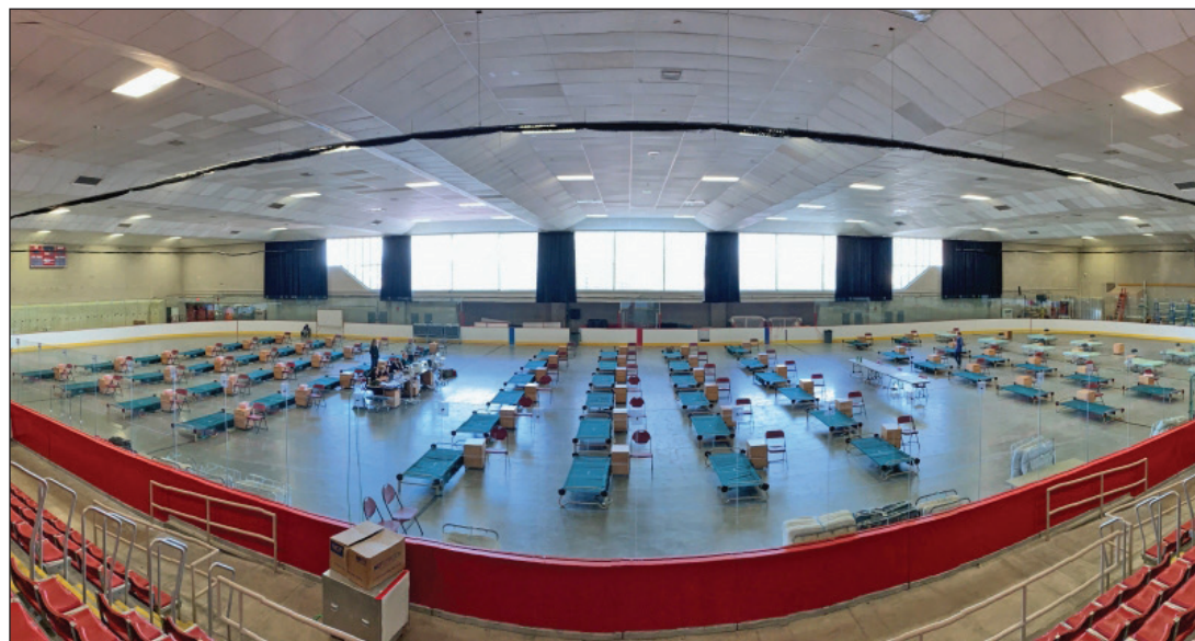
All patients at Johnson Track are assumed to have COVID-19 due to heavy breathing upon entry.