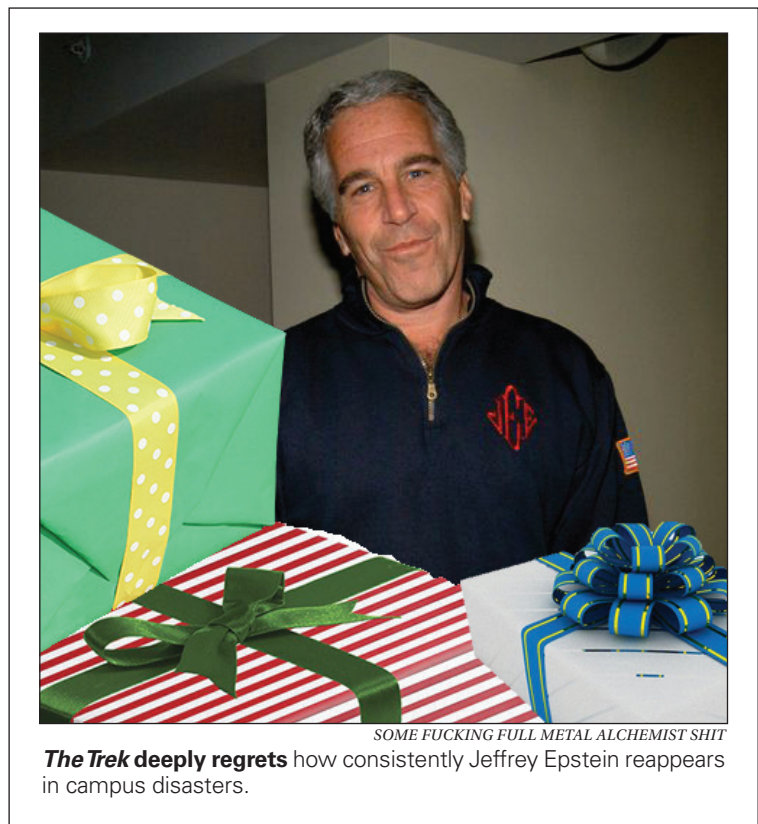
SOME FUCKING FULL METAL ALCHEMIST SHIT